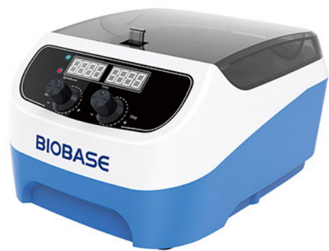
Mini-5S/7S/10S/12S (With Display)