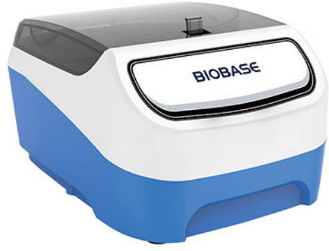
Mini-7S/10S (Without Display)

Mini centrifuges are mainly used for microcentrifugation, rapid removal of reagents from the test tube wall or test tube cover, and slow centrifugation of test tubes.